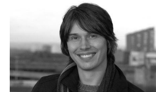
Professor Brian Cox

BABY BIBLE BUDDIES - Please note that we now meet on a Wednesday afternoon at 1.30 p.m.